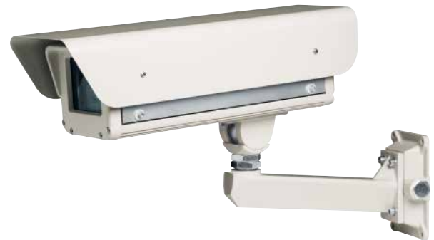
AVBPH + AVBPWBA