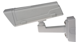
With AXIS T94R01P Conduit Back Box

AXIS T93F Series comes with a wall mount and an integrated sun cap. AXIS T94R01P Conduit Back Box, and AXIS Corridor Format Bracket A are available as optional accessories to increase installation flexibility.